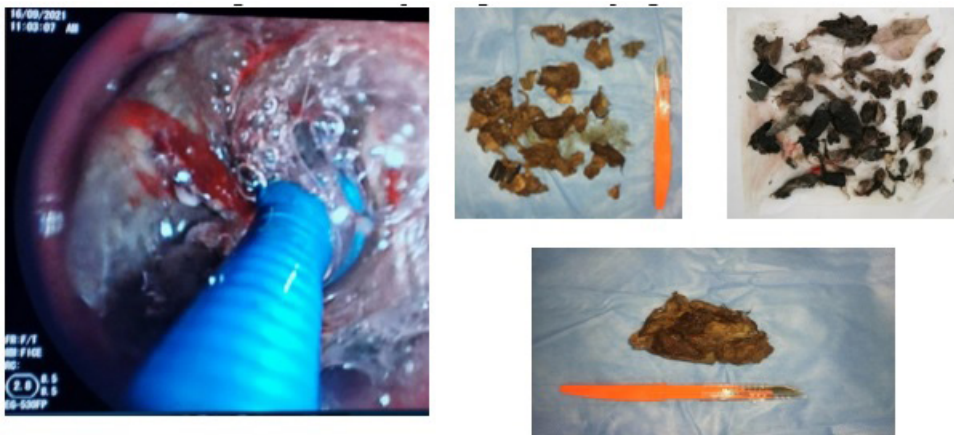
Figure 2: Endoscopic bezoar extraction