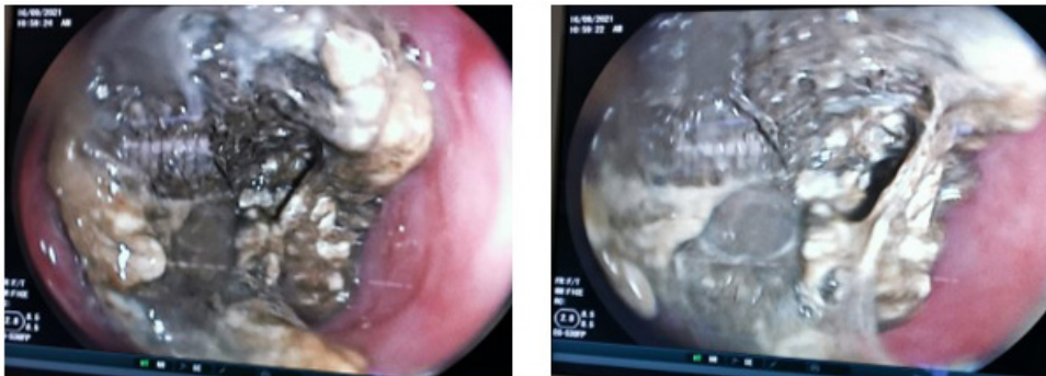
Figure 1: Endoscopic images of an esophageal bezoar.

After extraction, the child resumed his normal diet with no vomiting. a proton pump inhibitor and antibiotic therapy were prescribed.